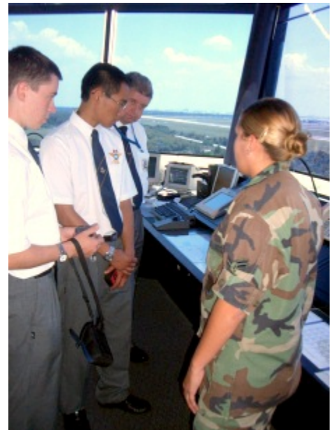
IACE Cadets touring control tower of MacDill Air Force Base

To learn more about the International Air Cadet Exchange program, visit the IACE website at http://www.iacea.com/ .